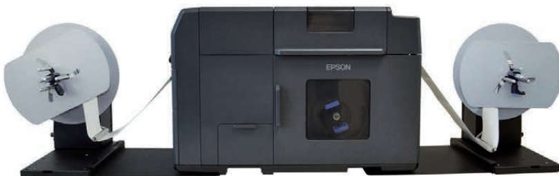
LABEL REWINDER (ASDIII-SO) - Epson C7500 printer - LABEL UNWINDER (ASSIII-SO) (Not included)

The new Unwinding/Rewinding system for Epson C7500 Label Printer can handle media up to 127mm wide and unwind/rewind label rolls having outside diameter up to 250mm. Units are equipped with a 3" or adjustable core holder (40-118mm).