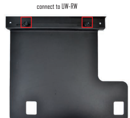
LW-RW printer plate for Epson C7500