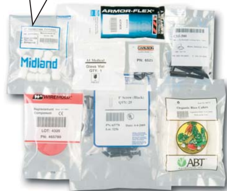
Actual Bag Samples