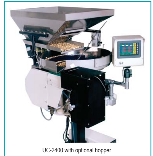
UC-2400 with optional hopper