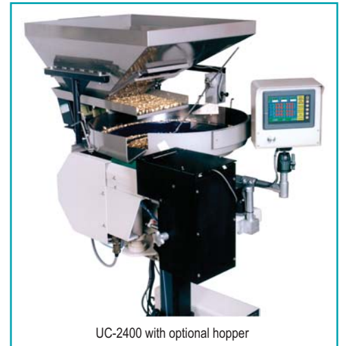
UC-2400 with optional hopper