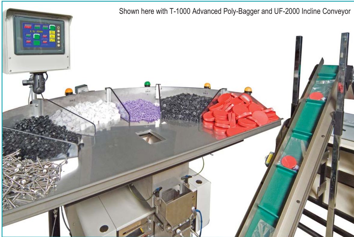
Shown here with T-1000 Advanced Poly-Bagger and UF-2000 Incline Conveyor

Take kit packaging to a new level! The semi-automation that kit packagers demand has never been easier to use with the addition of partitions and LED lights on the traditional load table. The lights signal operators to feed kit components. When weights have been determined, the scale automatically feeds the bagger and initiates cycle operation according to preset programming.