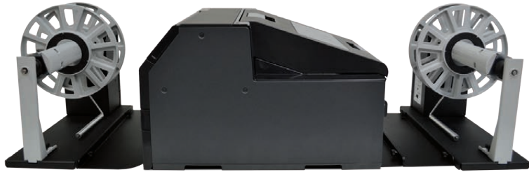
LABEL REWINDER (RW6500A) - Epson C6500A printer - LABEL UNWINDER (UW6500A) (Not included)