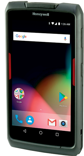
Honeywell's enterprise-class 7-inch tablet, the ScanPal EDA71, delivers real-time connectivity, fast data capture capabilities and enterprise-level reliability and protection.

The ScanPal EDA71 is comfortable to use and carry yet built tough to survive accidental drops and falls.