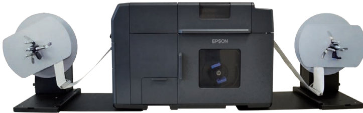
LABEL REWINDER (ASD1111-S0) - Epson C7500 printer - LABEL UNWINDER (ASS1111-S0) (Not included)

The Unwinding/Rewinding system for Epson C7500 Label Printer can handle media up to 5" (127mm) wide and unwind/rewind label rolls having outside diameter up to 10" (250mm).