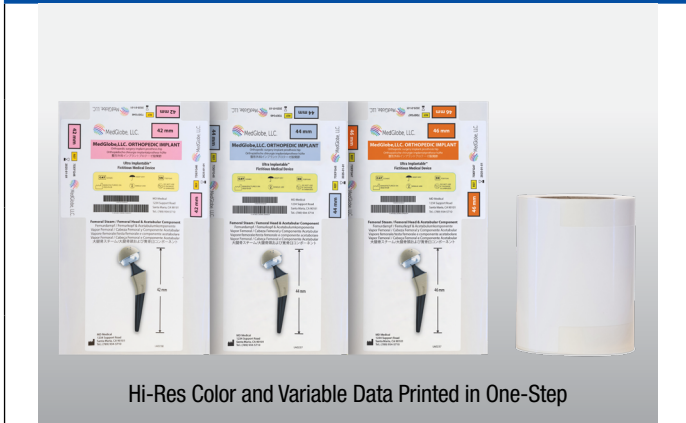
Hi-Res Color and Variable Data Printed in One-Step