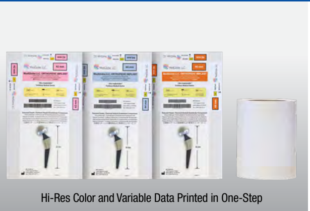
Hi-Res Color and Variable Data Printed in One-Step