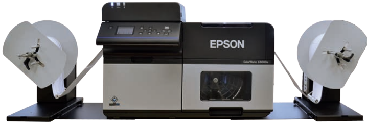
LABEL REWINDER (RW8000A) - Epson C8000 printer - LABEL UNWINDER (UW8000A) (Not included)

The Unwinding/Rewinding system for Epson C8000 Label Printer can handle media up to 5" (127mm) wide and unwind/rewind label rolls having outside diameter up to 10" (250mm).