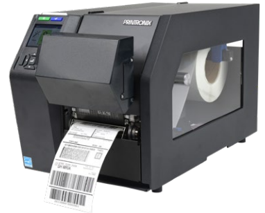
Barcode Verifier (T8000 ODV-2D)