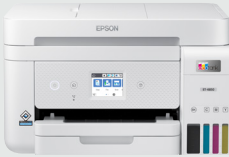
Consumer Inkjet Printers