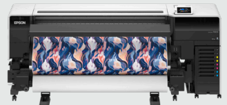
SureColor® Large-Format Printers