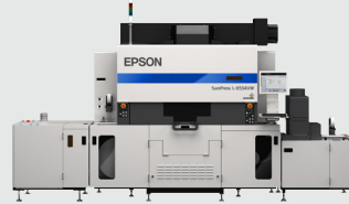
SurePress Industrial Label Presses