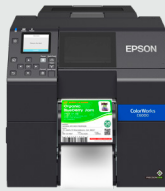
ColorWorks® Label Printers