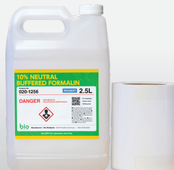
Hi-Res Color and Variable Data Printed in One Step