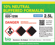
Two-Step Label with Potential for Misalignment