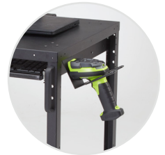
Easily integrate a wide variety of accessories