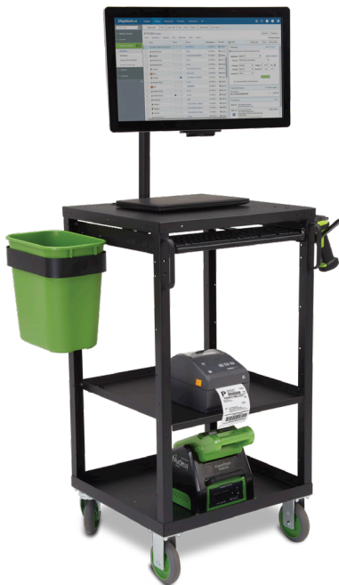
EC Series with PowerSwap Nucleus® MINI power system (includes stand-alone charging station)