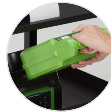
Simply swap with a fully charged pack in seconds