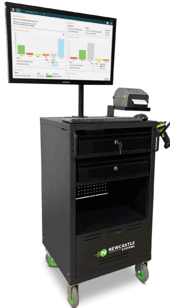
Enclose the EC Series cart with optional set of metal side panels (B434) and metal rear panel (B435) or metal pegboard panel (B433)