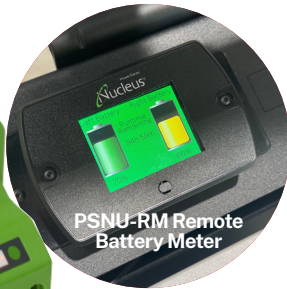
PSNU-RM Remote Battery Meter

Advanced monitoring unit that measures and displays your battery's remaining runtime