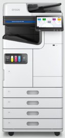
Business Inkjet Printers

Epson produces over 15 million printers every year, with permanent printheads designed to last the life of the printer. From our industrial SurePress® digital label presses to our retail inkjet printers, the PrecisionCore print chip is at the core of virtually all of our printing solutions.